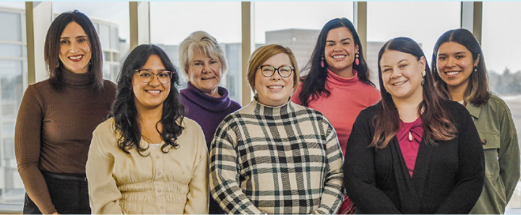
Back Row (Left to Right)